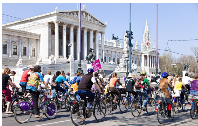
'Vienna Bike Parade'

In recent years, the Vienna 'Bikefestival' has been accompanied by the 'Wiener Radparade' ('Vienna Bike Parade'), where people enjoy cycling on a car-free ring road in the city centre of Vienna (for more information see also 'S-3 Car Free Days'). These events are organised with the support of associations, as well as media and advertising partners. Cooperation partners for these