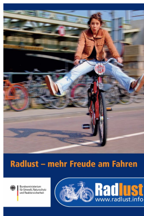
Poster from the campaign 'Radlust' ('Joy of Cycling')

An example for this is the campaign titled 'RadLust' ('Joy of Cycling') that was designed as a mobile 'poster show' by students from the University of Trier and can be used within the framework of local actions. A special feature of the campaign is that it wants to win over through evoking emotions and not through arguments.