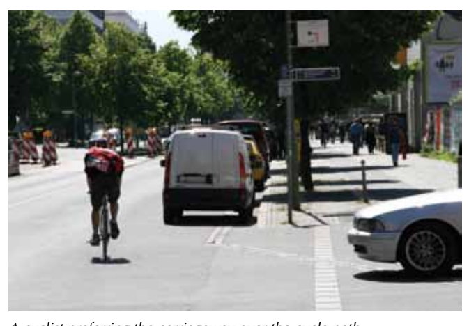
A cyclist preferring the carriageway over the cycle path

Since the 1980s the safety of cycling has been a major focal point of research programmes in Germany, mostly conducted by the Federal Highway Research Institute (BASt). New elements of cycling facilities were reviewed for their specific safety effects. The advised "safety lanes" were a particular focus point; the presumption from the older ERA 1995 that they might be only appropriate at minor car frequencies was disproved. They also work well in roads with a higher volume of traffic, but only where motorists have sufficient space to overtake cyclists.