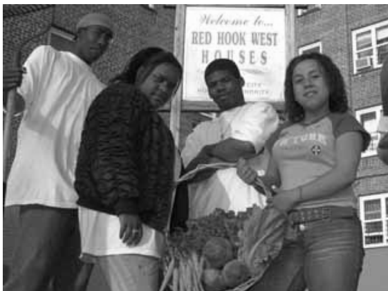
Added Value youth farmers, New York

In 2004, Added Value signed a five-year Memorandum of Understanding with the City Department of Parks and Recreation for use of the Todd Memorial Ballfield. In exchange for minimal rent, the group was then able to develop the Red Hook Community Farm on the abandoned 2.75 acre site. This represented the culmination of several years of planning and work with city officials. In 2002, Added Value staff discovered the site, formerly a football and baseball field that served the area's dock-workers, that had been abandoned after the city, following years of community pressure, constructed improved facilities nearby. The group brought a proposal for using the site as a farm to community and church groups for their approval, then to the local Parks Department manager, who was receptive. After several refinements, the proposal was approved by the Brooklyn Parks Commissioner and then received unanimous approval from the District 6 Community Board. 68 The farm currently produces over 40 types of produce on raised beds on a one-acre portion of the site. There are plans for greenhouses and structures for livestock, composting and vermiculture, which will be developed as funding allows. The initial vegetable garden required no permits, but plans and permits for the expanded garden are still in negotiation with the Parks department.