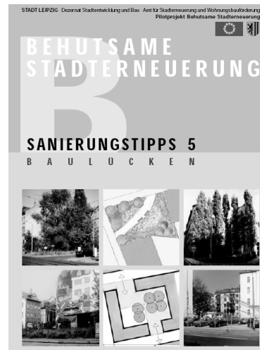
Interim Use Guide, Leipzig