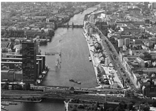
Berlin Friedrichshain and the Spree River