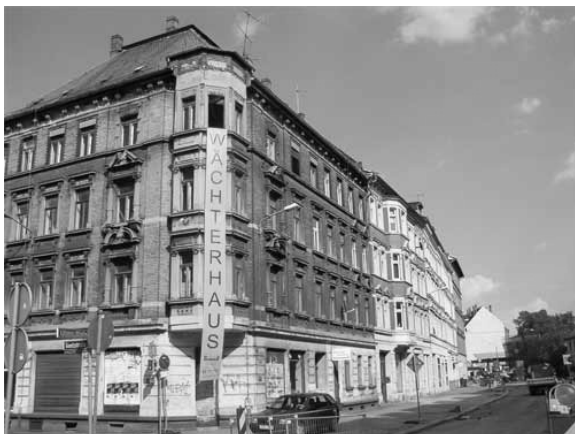
'Save the House' building, Leipzig