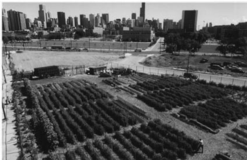
City Farm, Chicago

When a replacement site is needed, staff from the Environmental Department provide Dunn with a list of possible sites for him to choose from. This list is not made available to other users seeking temporary sites. Farm staff have found that a minimum of a one-acre lot is needed to make the economics of production work.