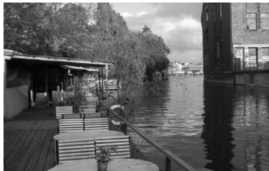
Freeswimmer Bar and Restaurant, Berlin