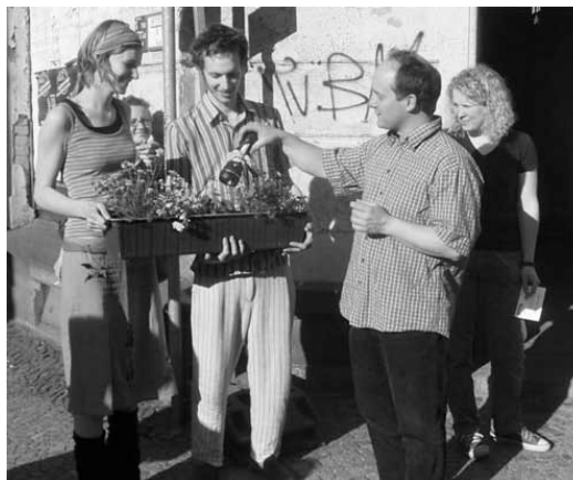
'Save the House' residents, Leipzig

A second notable project in Leipzig is the 'Save the House' project, which is an effort to stem the loss of Gründerzeit housing stock from the city. According to city estimates, there are still more than 1,000 empty Gründerzeit buildings in the city, many along high-traffic corridors which make them less desirable for renovation. The Save the House program offers five years of free rent to people willing to live in these vacant buildings. Tenants undertake basic maintenance and small repairs, and notify the landlord of larger problems. The program began in early 2005 and as of the end of the year, there were two pilot project houses occupied to date. A non-profit, also called Save the House, was formed and receives funding from the city to market the program. This organization also helps match owners and users in much the same way as city coordinator Will works with owners and users of open space. 55 Given the physical conditions of this housing stock and the large number of vacant homes, it seems likely that the organization will be chal-