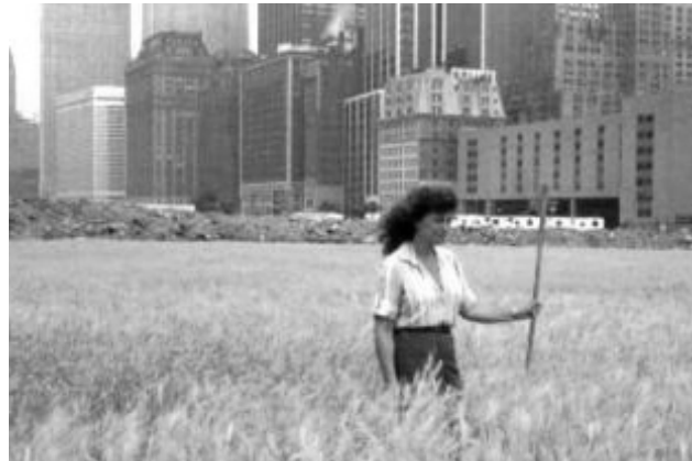
‘Wheatfield : A Confrontation’, New York City

In the United States, New York is well-known for its interim uses, namely through its long and contentious history of community gardens. Other interim uses there include the artist Agnes Denes’ 1982 project, ‘Wheatfield: A Confrontation’, in which she transformed two acres of vacant land in lower Manhattan into a field of wheat for one growing season