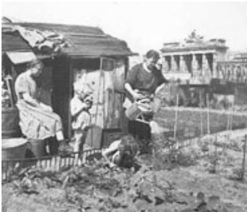
Tiergarten with Brandenburg Gate in background, Berlin