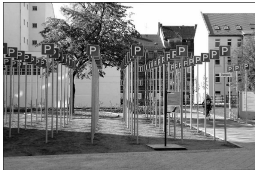
'Stattpark', Leipzig