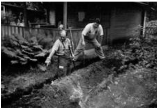
Intercultural Garden Köpenick, Berlin