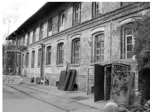
R.A.W. Tempel building under renovation, Berlin