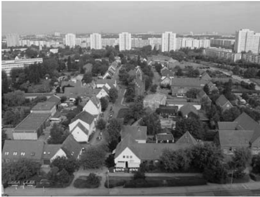
Marzahn-Hellersdorf, Berlin