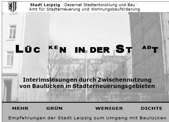
Interim Use Postcard, Leipzig