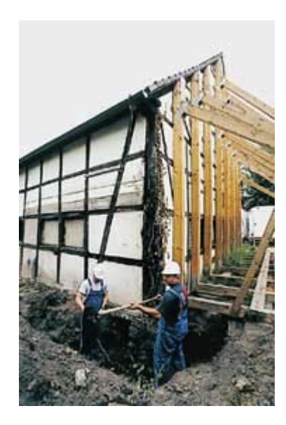
Conversion work on the old stable of the Lahrshof

Positive aspects of the programme area that should not be ignored are its proximity to the inner city and the good transport infrastructure, as well as the associated advantages as a residential location. Also worth mentioning is the range of local social and cultural infrastructural facilities that has increased considerably in recent years (e.g. Protestant comprehensive school, Lahrsdorf Health House, Haverkamp Social Centre), which give important impetus to district life.