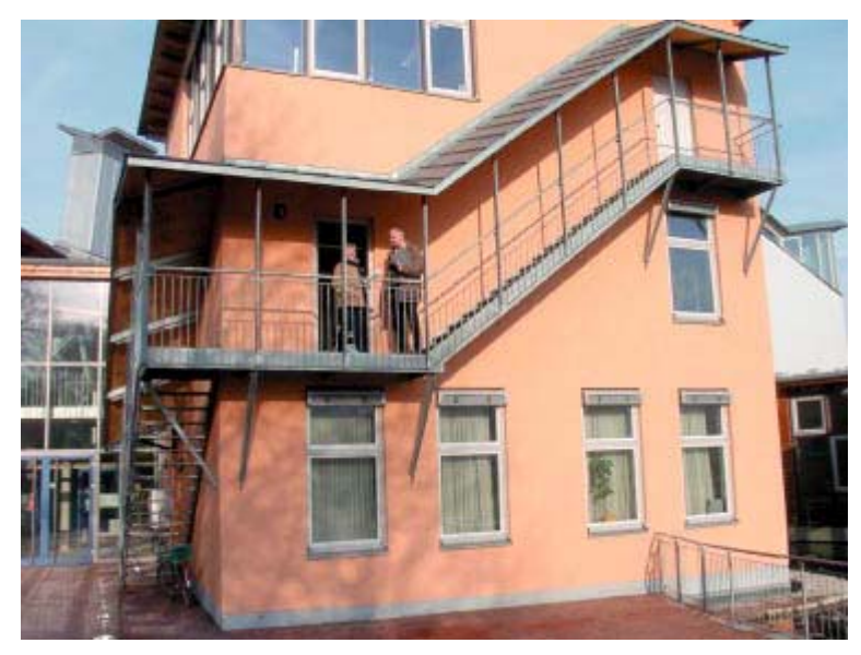
The Bismarck/Schalke-Nord District Bureau

planning authority is responsible for the facility. A solution relatively close to the administrative authorities has thus been chosen for the decentralised project management. It could conceivable also have been placed in the hands of charitable organisations, associations, or other non-governmental organisations. However, care has been taken in Gelsenkirchen to grant the District Bureau enough autonomy from the regular administrative authorities to allow projects and ideas to be realised in the programme area independently and in the short term. In comparison with similar institutions, the Bismarck/Schalke-Nord District Bureau also has a comprehensive understanding of district management, for, apart from its functions in networking local actors and involving residents, it is also concerned with programme planning, project development and coordination, and handling public grants.