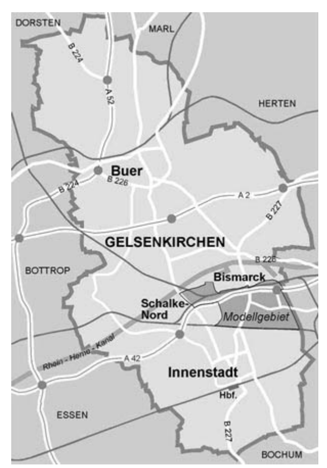
Model area location in the city

Positive aspects of the programme area that should not be ignored are its proximity to the inner city and the good transport infrastructure, as well as the associated advantages as a residential location. Also worth mentioning is the range of local social and cultural infrastructural facilities that has increased considerably in recent years (e.g. Protestant comprehensive school, Lahrsdorf Health House, Haverkamp Social Centre), which give important impetus to district life.