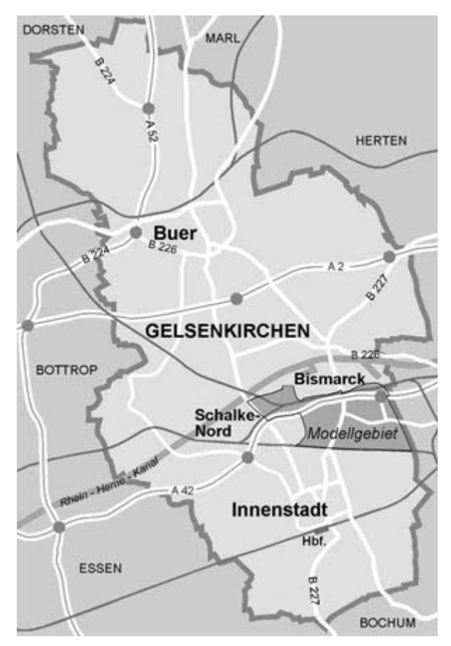
Model area location in the city

One of the main problems is the marked decline in the population of the programme area (currently 18,600) which has been going on for years now owing to deindustrialisation. 19% of the local population - the highest proportion within Gelsenkirchen - are foreigners (some 75% of Turkish origin) and much younger than the German population. Local child-care institutions and schools - in some classes more than 70% of the children are of foreign origin - therefore have to make considerable efforts to achieve integration.