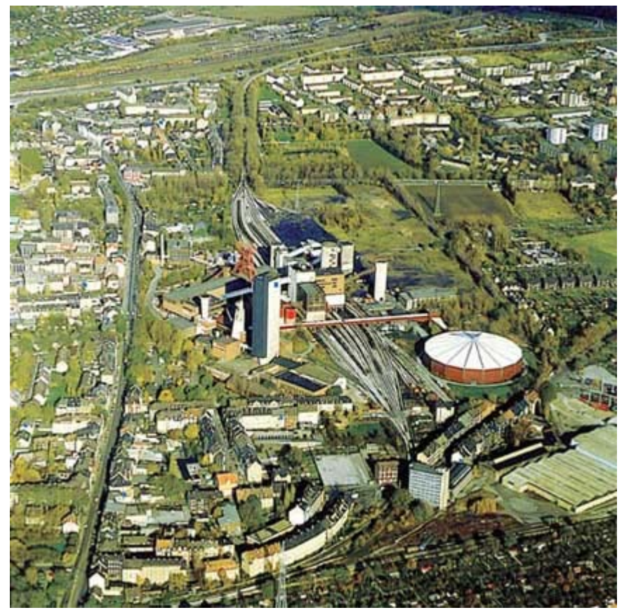
Oblique photograph of the Consolidation mine and surrounding areas of Bismarck before closure in 1995