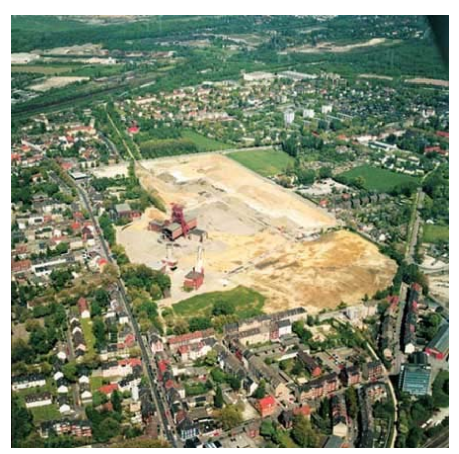
Oblique photograph of the Consolidation mine after demolition